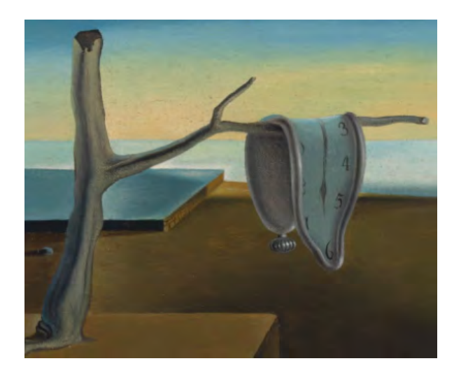
George Santayana (1863 Madrid Spain-1952 Rome Italy) reflected on The Phases of Human Progress in his

Today, an entry level MacBook Air retails for $999 with 256 GB RAM (256,000 MB, or 256,000,000 KB). The MacBook Air also comes with a 13.3 inch display of 4 million color pixels and 2560 x 1600 resolution, stereo speakers, 2 Thunderbolt 3 (USB-C) ports, Apple T2 Security Chip, and weighs 2.8 pounds. Included creativity and productivity applications (apps): Pages, Numbers, Safari, Mail, Messages, FaceTime, Calendar, Reminders, Photos, iMovie, GarageBand, and Siri. For a few hundred dollars, can expand SSD storage to 2 TB (2,000,000,000 KB).